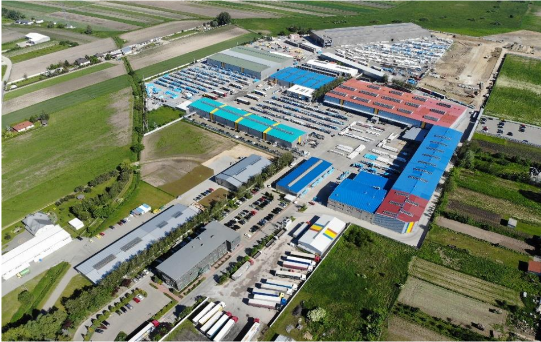
Fig. 1. A view of the Pruszyński Sp. z o.o. production hall in Sokółów (Poland).

Pruszyński Sp. z o. o. the Polish producer of construction products. The core of the activities are: steel roofing, elevation, trapezoidal steel sheets, sandwich panels and cold-formed profiles.